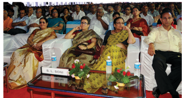
The August Gathering