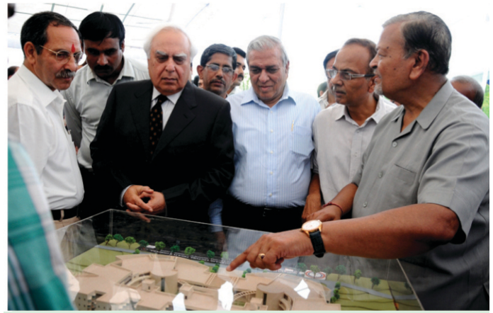
Chief Guest Hon'ble Shri Kapil Sibal watching Model of the New Lecture Complex