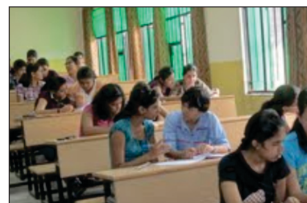
Participants of Quiz

Akshay Urja Diwas. 200 teams (80 from outside MNIT) participated in the