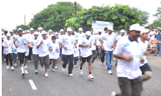
MNIT Marathon Beginning

Welspun will provide scholarship to two M.Tech. students of the department of Metallurgical and Materials Engineering and also shall contemplate joint research projects.