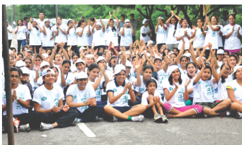
MNIT Marathon Girls Participants

❖ To mark the beginning of the Golden Jubilee year, a 'Mini-Marathon' was organized at MNIT Jaipur on Sunday August 26, 2012 with the message of 'Go Green' to create awareness about conservation of the