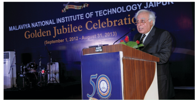
Hon'ble Shri Kapil Sibal (Minister of HRD & Communication and IT, Govt. of INDIA) Chief Guest, Delivering his address