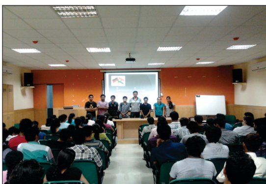
Student Interaction during orientation session

❖ The Institute conducted an Awareness Program at the Design Centre on August 6, 2012 , for increasing awareness about Summer Internship in Foreign Universities. All the students who have been to various universities in Germany, Switzerland, etc. shared their