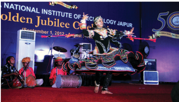
Kalbelia Dance by - GULABO