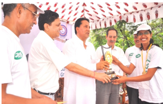
MNIT Marathon Girls Champion