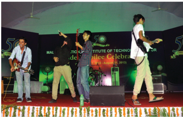
Students' Band Performance