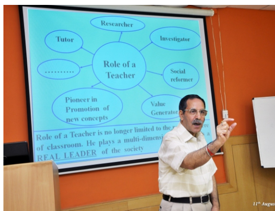
Director delivering Lecture to new faculty members at Induction Program

An Induction Program for newly recruited faculty was organized on August 11, 2012 which included an interactive session with the Director. There were five sessions in the program in which the newly recruited 27 faculty members belonging to various