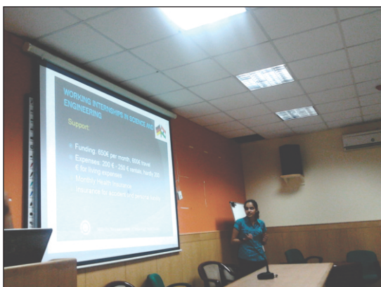
Orientation Session for Foreign Internship

experiences with the participants. Benefits and opportunities through such internships were discussed with the