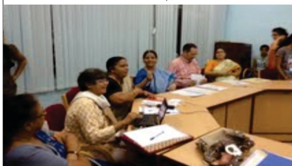
Workshop by Women's Cell