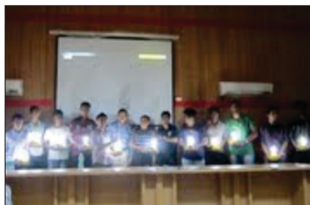
Winners of Quiz

❖ The Centre for Energy and Environment organized 'Sustainable Energy and Environment Quiz' (SEEQ-2012) on August 20, 2012 on the occasion of Rajiv Gandhi