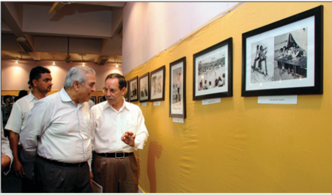
"SHADES OF MNIT" Photo Exhibition MREC to MNIT 50 Golden Years Photo Journey...