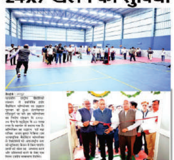
विद्यार्थी कोर्ट में बैडमिंटन खेल रहे छात्रों की एक समूह तस्वीर। एमएनआईटी के इंटरनेशनल स्टैंडर्ड बैडमिंटन कोर्ट का उद्घाटन हुआ। इस कोर्ट में 5000 छात्रों को 24x7 खेलने की सुविधा मिलेगी।