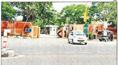
The MNIT Jaipur campus. The first batch will have 40 students